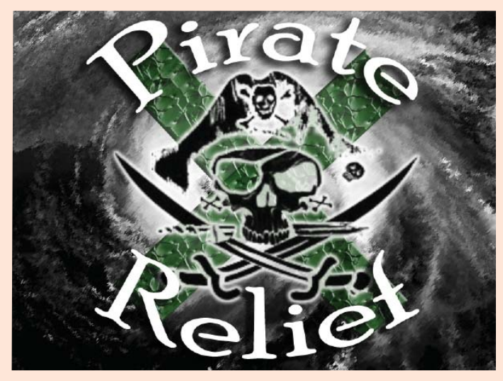
An Arts Project & Organization Celebrating the Living Myth

approaching areas affected such as tradjedies like the Gulf oil spill, the Pacific Trash Island, and how to address pollution issues with our waterways.