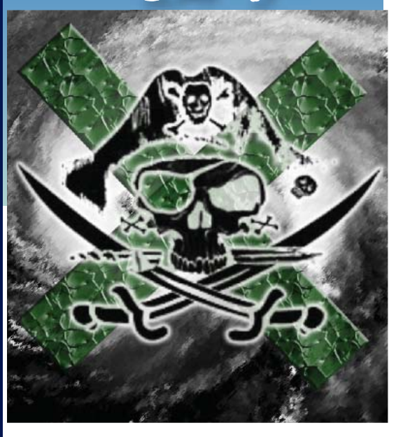
Entertainment, Ecology, Arts, Relief, Myth, Lore, & Sustainability